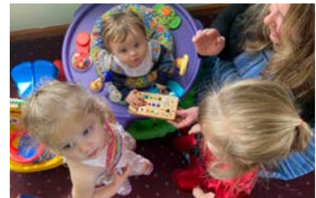
WE LOVE OUR NURSERY KIDS!