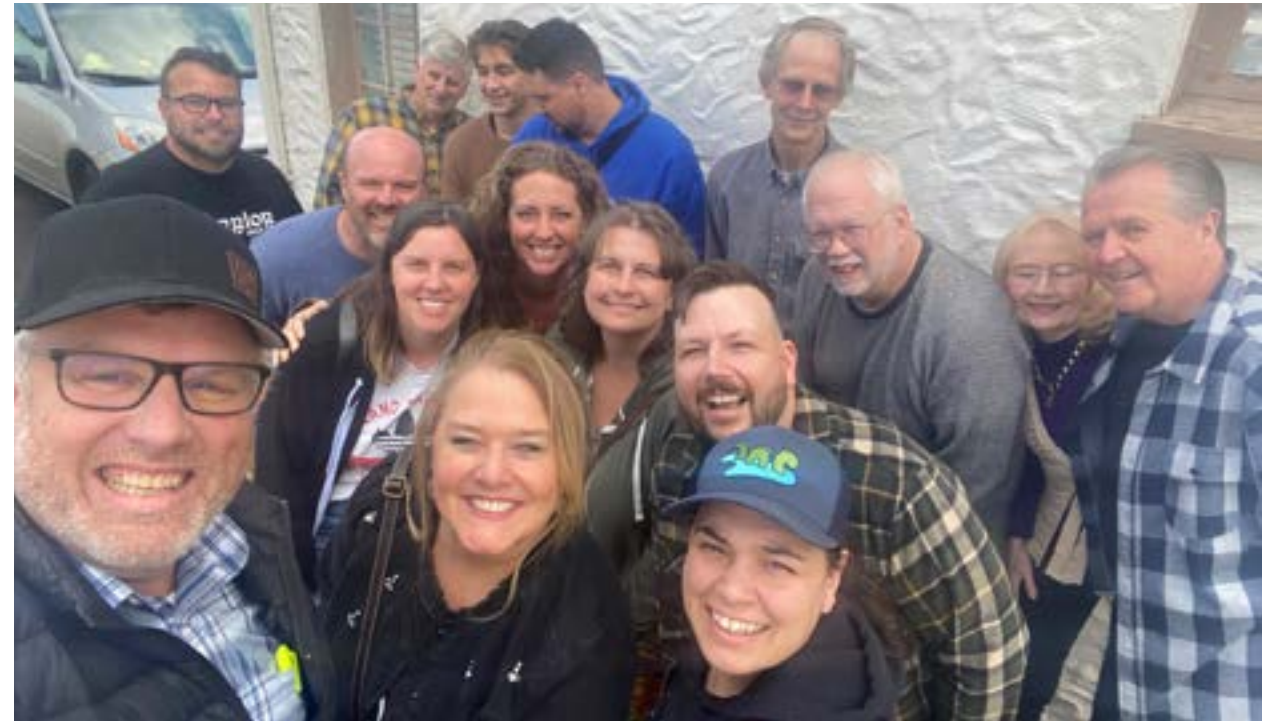
PASTORS AND LEADERS OF SOUTHCOAST FOURSQUARE CHURCHES