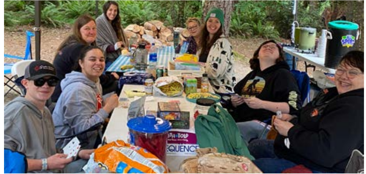
CARD GAMES AT FAMILY CAMP, 2023

We see each other on Sundays. We work together on ministry teams. We get together for events and gatherings as we navigate our schedules and routines. But there is something special about taking time away from "life" and sharing quality face-to-face time with each other out in nature. Being with each other as we disconnect from